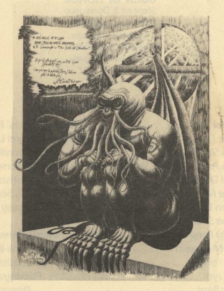
October 31 - November 3, 1985 At Tucson's Doubletree Hotel at Randolph Park